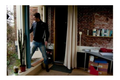
Memory 1: here the drawings appear on the windows, reproducing the objects the woman touches. She doesn't notice them.

She will look at the objects on the desk and picking them up or touching them. a framed picture of her father with her as baby also get to be faced down. {\it Memory}\ 1