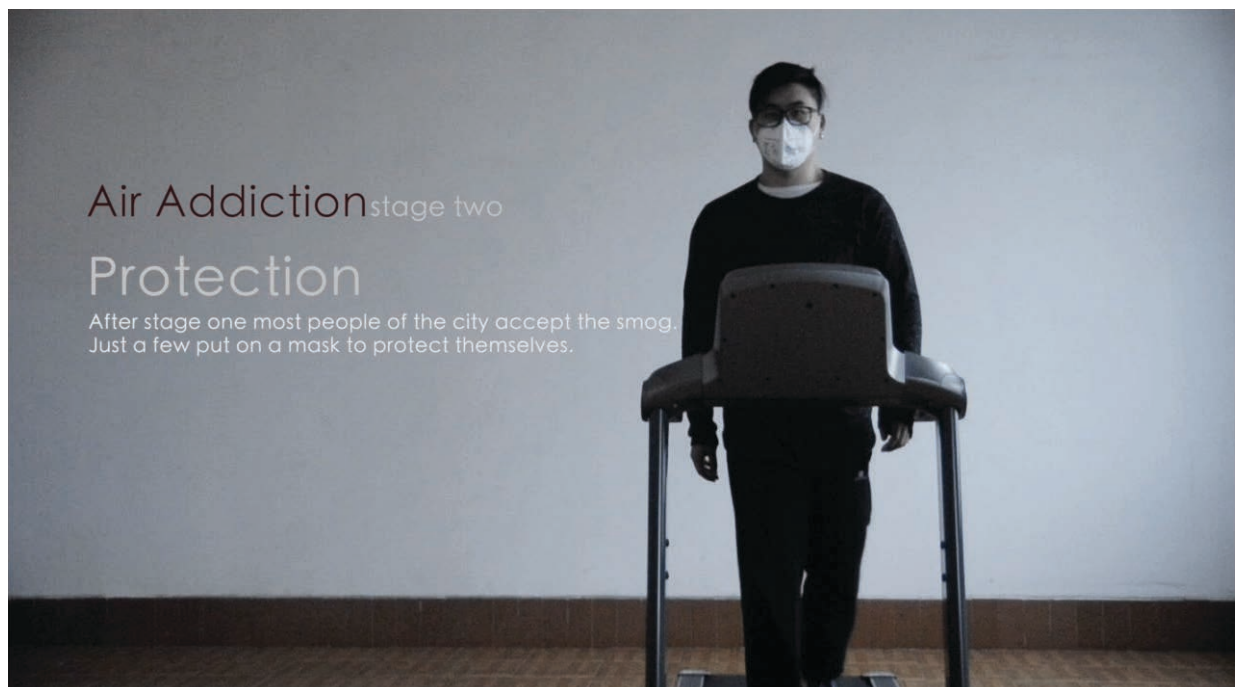
Still from Air Addiction

Before I started this project in 2014, major cities across China were mostly polluted. Luckily my hometown, a small city located deep in mountains in Hubei province, still remained clean. However, within a few months, everything has changed dramatically, haze swallowed my city with no mercy. The increasing severe lung infection made local hospital became the busiest place. Patients were mostly children and elders since they were more susceptible than adults to haze. I saw my own family members suffering from coughing and non-stop fever. It was then that I realized that there was no place to hide and I cannot simply be an outsider.