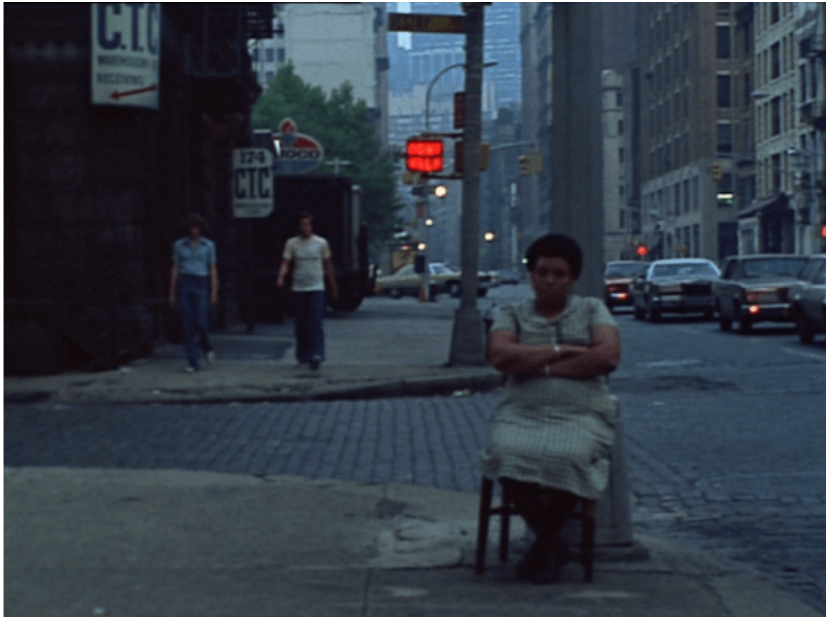
Still from News from Home by Chantal Akerman, 1977

the script out loud in the native language and used the sound as the voice-over. The image of this film came from the previous project, Air Addiction , I picked up a few scenes and edited them in slow motion.