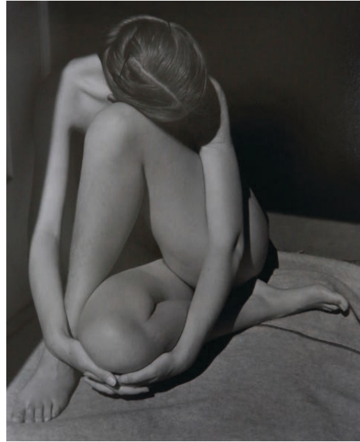
Nude by Edward Weston