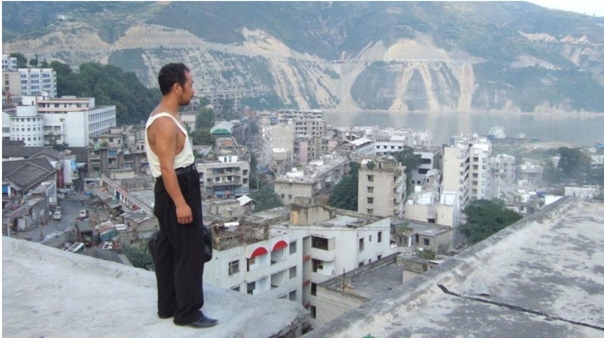
Still from Still Life