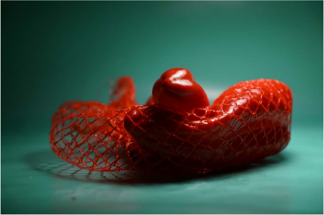
Sexy Pepper No.1