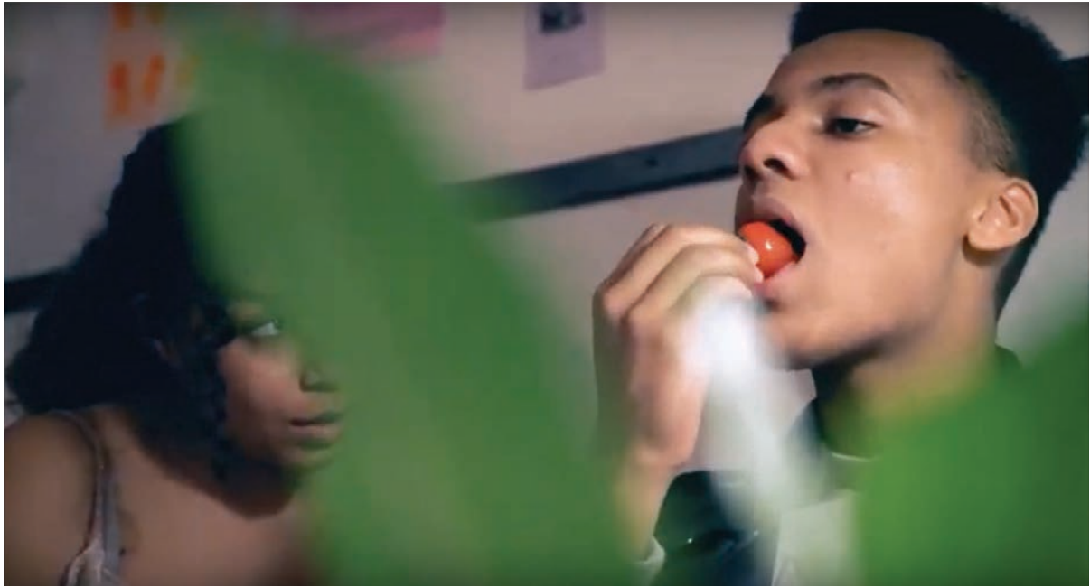
Still from Intersection

Intersection is structured by a duality – a man and a woman; the past and the future; the traditional and revolutionary; the safe and the risky. There is a bridge between the present and the future that is crossed by some stylistic devices and scenes, such as the magic fruit, location, colors and the way the individuals behave and the way in which they are shot. I was inspired by Fifteen Million Merits , which I noticed this state of movement from one state to another also occurs in its plots: In a world where most of society has to cycle on exercise bikes to support their lives by earning a currency called “Merits”. Bing meets Abi and trying to convince her to participate in the talent show, so she can escape the slave-like world. Bing exchanges his entire stock around fifteen million merits for a ticket of the talent show, so Abi can sign in for the audition. Bing tries to help the girl to live a better life in the future and he scarifies himself. In Intersection , the man gives the fruit to the girl that shows his motivation of protecting her from sexual violence. The male plays as a hero or a redeemer in both films, the story is mainly about a process in which they try to help the female to change the status and break down the potentially danger in their present lives.