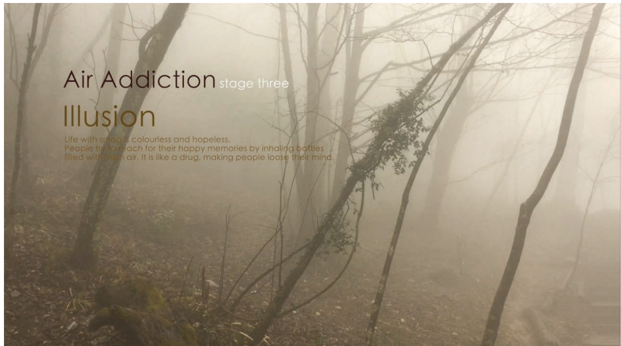
Still from Air Addiction