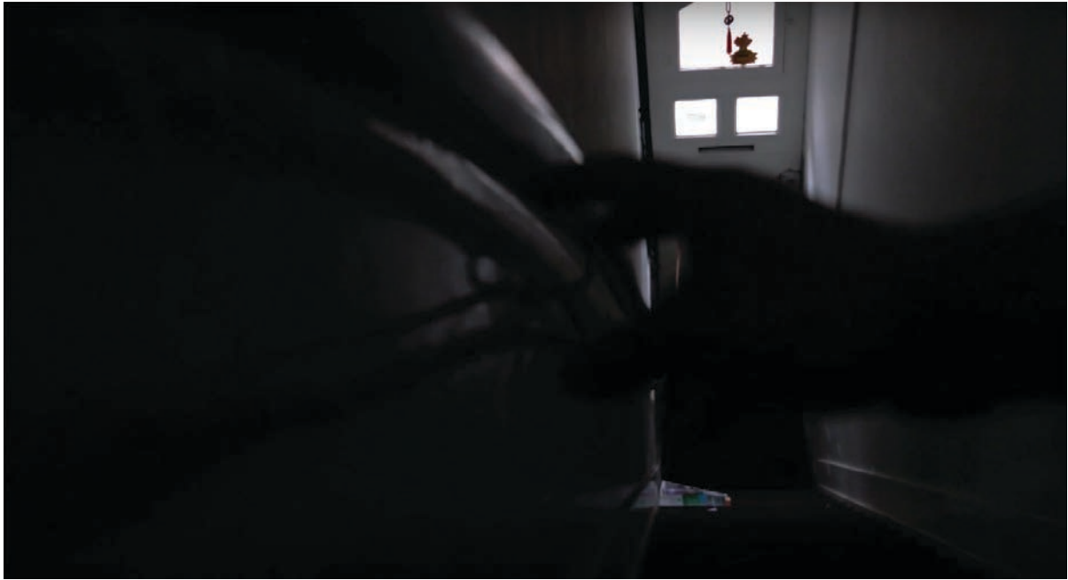
Still from After Living in Holland for One Year