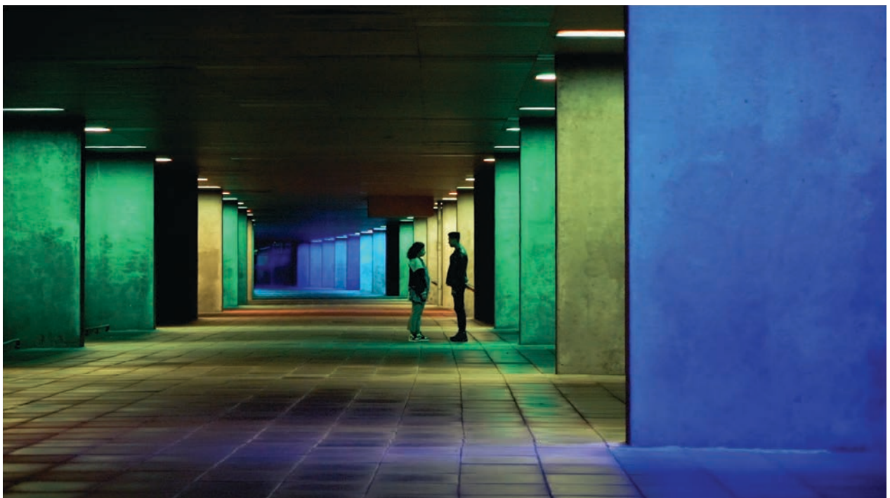
Still from Intersection