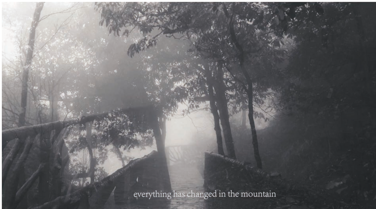
Still from Walk Slowly

Walk Slowly is a short film that shows the mountain view in a heavy hazy day in China. With low visibility, everything looks extremely mysterious and beautiful. My family and I were walking in the mountain. However, the truth behind this peaceful scene was the terribly polluted air and a worried normal family. I asked my mother to walk slowly to avoid too much polluted oxygen to be inhaled. Somehow it reminded me of her concerned words of walking carefully when I needed to go to school alone. A sweet reminder changed into a strict order because the reason behind it transformed dramatically. This was an experimental film of using the metaphoric narrative approach from a personal angle to point out a bigger phenomenon. The script was developed from conversations from my mother and me in two different periods. I read