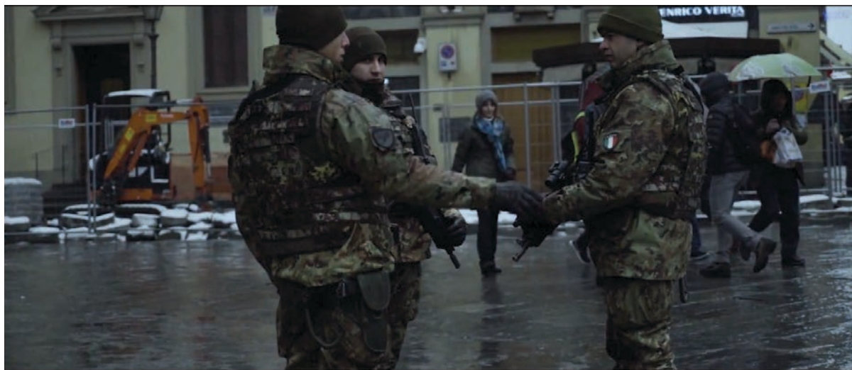
Still from Slow in Florence

Out of blue, Florence in Intersection is shown as a city full of sadness and coldness. Raindrops dropped from the ceiling, strong wind blown them on people who were trying to hide underneath the shelter, and it made them frustrated. The road was iced in the evening and became extremely slippery, local people walked slowly and carefully with their heads down, the sound of their footsteps was particularly clear in the stillness of the morning. Some people that have watched this film said that it reminded them of Italy during World War Two as if everything was dying and everyone was full of fear. However, I did not construct such a negative emotion on purpose, I felt the city was surprisingly outstanding and eye-catching in the foggy and dusky day.