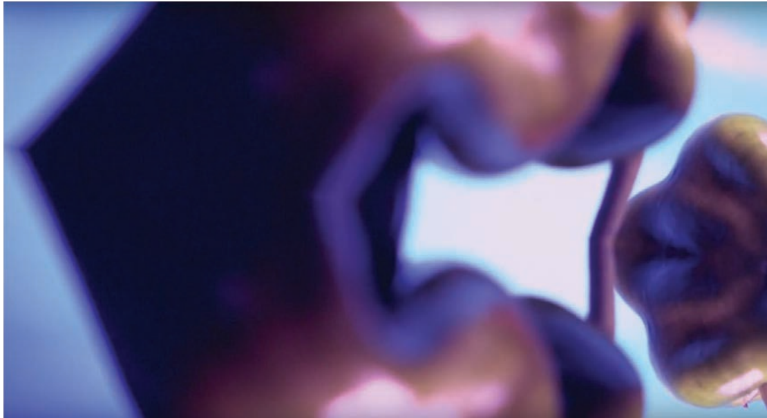
Still from Intersection

This film asked for many difficult camera skills, for instance, I wanted to shoot in a long take, actors doing non-stop performance and the camera follows all the way. The camera combined with a normal tripod are not possible to capture the image without jitter, especially in the last scene, actors were asked to run towards each other in a long tunnel, I wanted the camera to move together with the actor, the visual effect is to create a strong sense of participation for the audience. To do so, I purchased a stabilizer to let the camera remain still while even running. With this new device, I have explored many new possibilities of shooting, many different perspectives that could totally change the narration in the film has been used during this project.