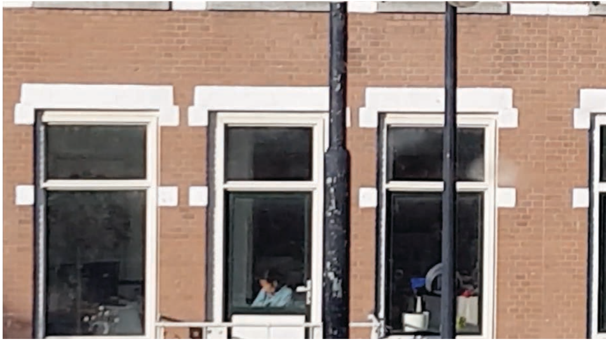
Still from 4 Rooms

4 Rooms is an experimental short film shot from the window of my room. There is a big building in front of my house and it blocks all my view. I can watch nothing else but these four rooms. Each of these rooms have big windows, which generously shows me what happens inside. I observed inhabitants from those rooms and with time I got familiar with their living habits. In this film, the scene slowly zooms in on each room; meanwhile, the soundtrack of my descriptions of what was happening inside the room is playing in succession before the related image appears.