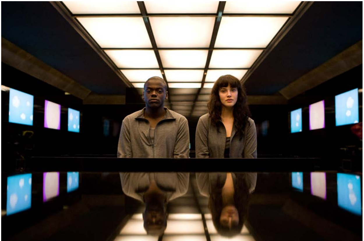
Still from Fifteen Million Merits