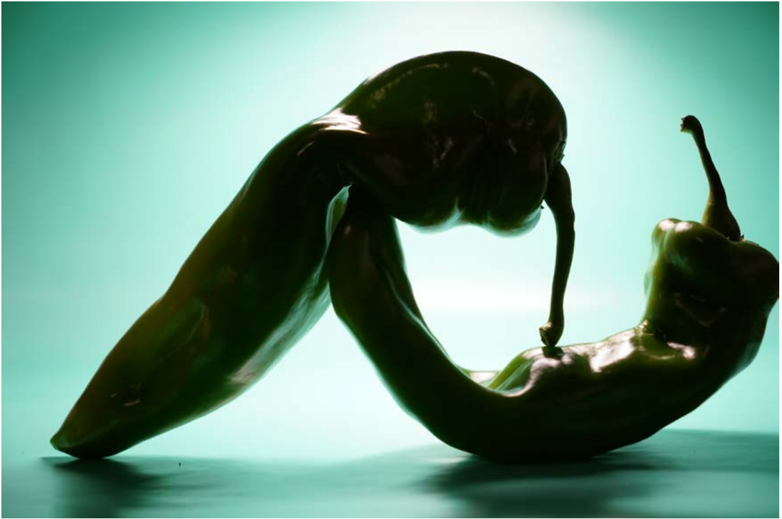
Sexy Pepper No.2