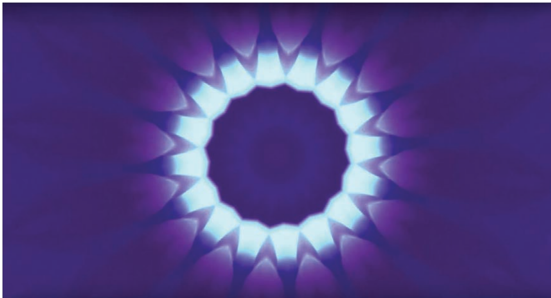
Still from Intersection