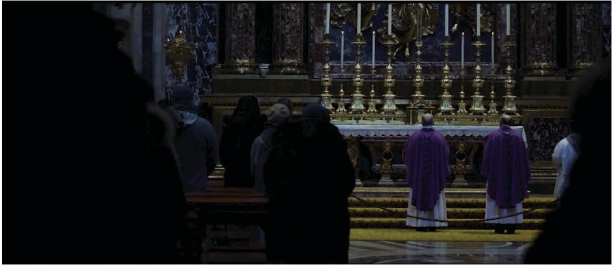
Still from Slow in Florence