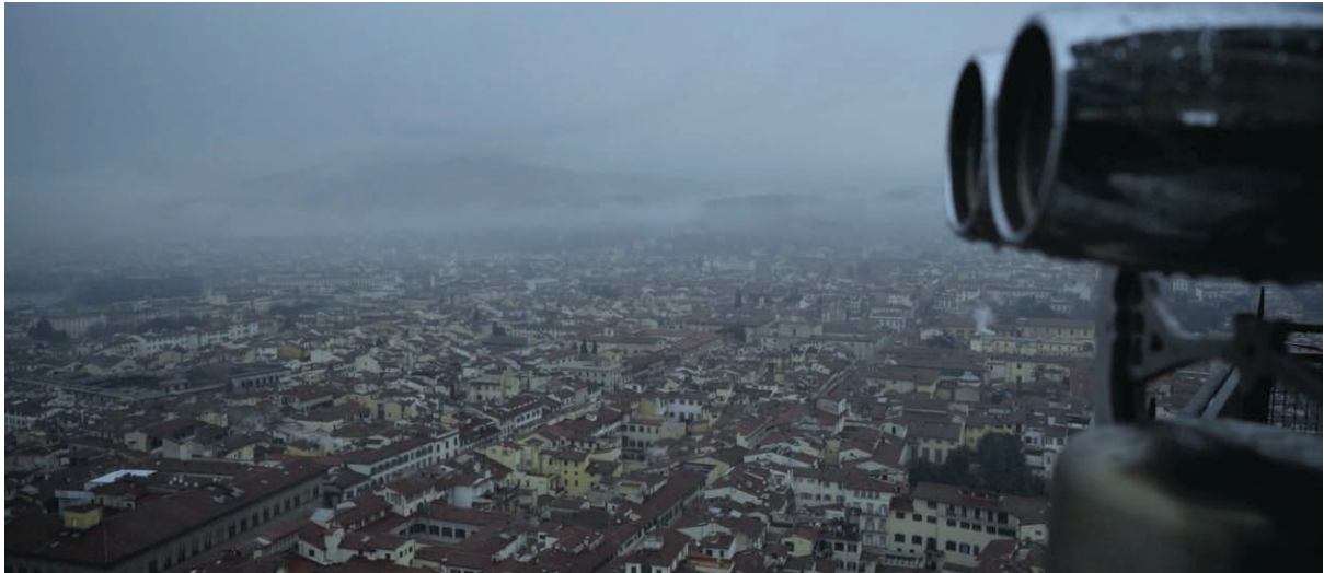
Still from Slow in Florence

Slow in Florence is a short film documented my trip to Florence in Italy in the winter of 2017. On a rainy and snowing morning, the temperature dropped to minus 2 degrees, a long queue of visitors stood outside of the Florence Cathedral, people were all waiting to climb to the top of the church and appreciate the beauty of the city. Florence is a live museum, among majestic buildings, medieval palaces and impressive monuments, it was hard to decide where to watch first. However, the heavy fog blanketed the whole town and it reduced the visibility, red architectures gradually disappear in the white fog and eventually merged with mountains further away. The view reminded me of a Chinese poem Ode to a Lady's Pipa Play by Bai Juyi. The poem describes a beautiful woman: Only after our repeated calls did she appear; her face stills half hidden behind a pipa lute. Just like in the poem the rain Florence showed me her beauty in the extremely mysterious and fascinating way, it totally differed from the stereotype impression.