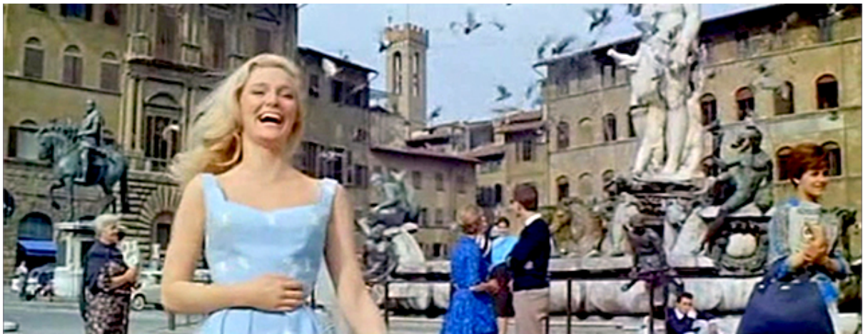
Still from Light in the Piazza

As we all know, Florence is considered as the birthplace of the Renaissance, Revealing Rome in its art galleries and libraries, (THE CITY OF FLORENCE, ITALY. 1877) It is a place where people can easily capture the moment of beauty, especially for filmmakers, it seems like a random corner can be constructed as astonishing scenery in a film. There are many great films that framed in Florence, for example, the romantic film Light in the Piazza made by Guy Green in 1962, Florence left a sweet impression where a love story began, Clara, who is a mentally ill American lady, met an Italian man n Fabrizio on a sunny afternoon at a square in Florence. They fell in love at first sight and finally got married in Italy.