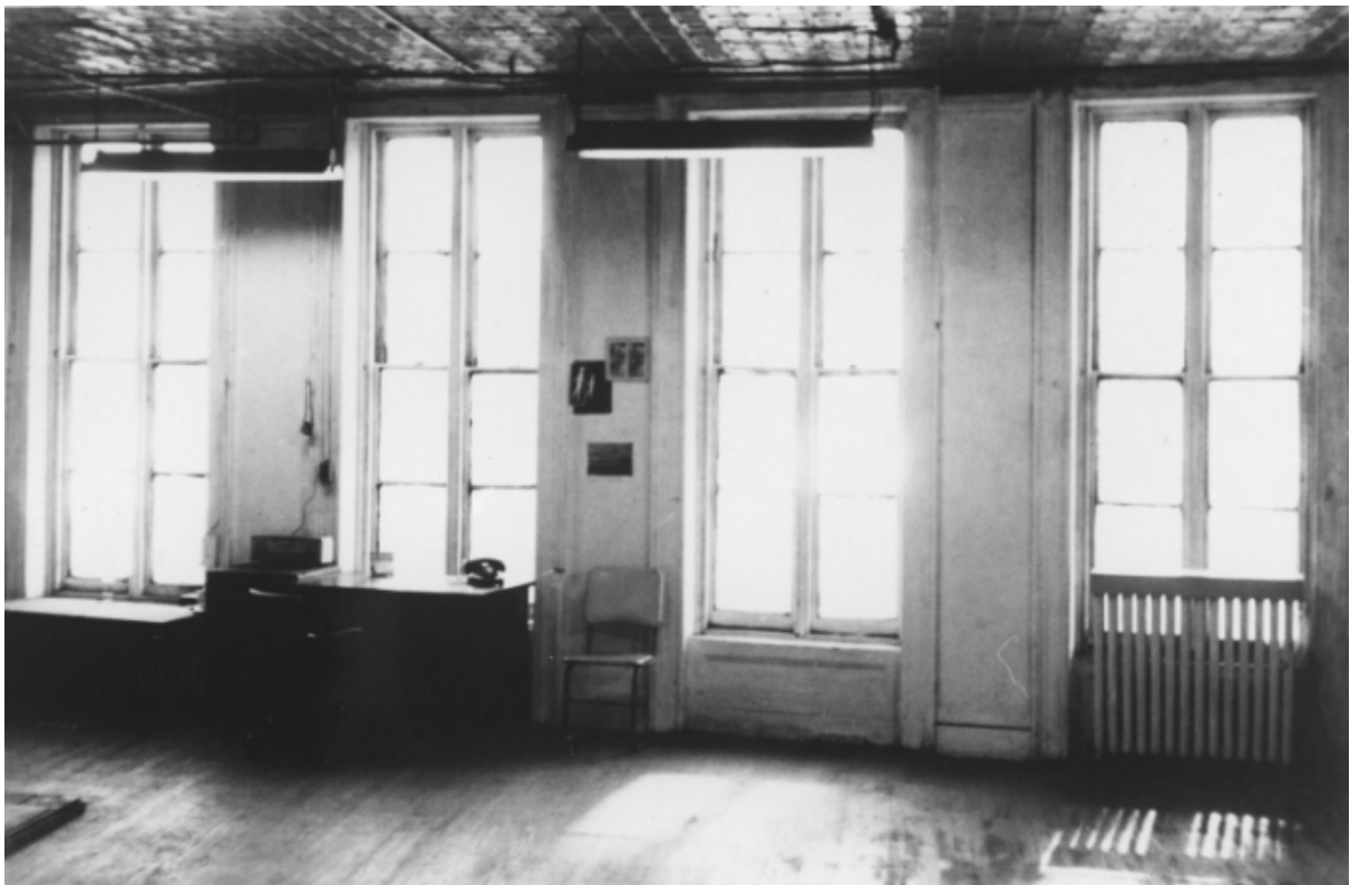
Still from Wavelength by Michael Snow 1967