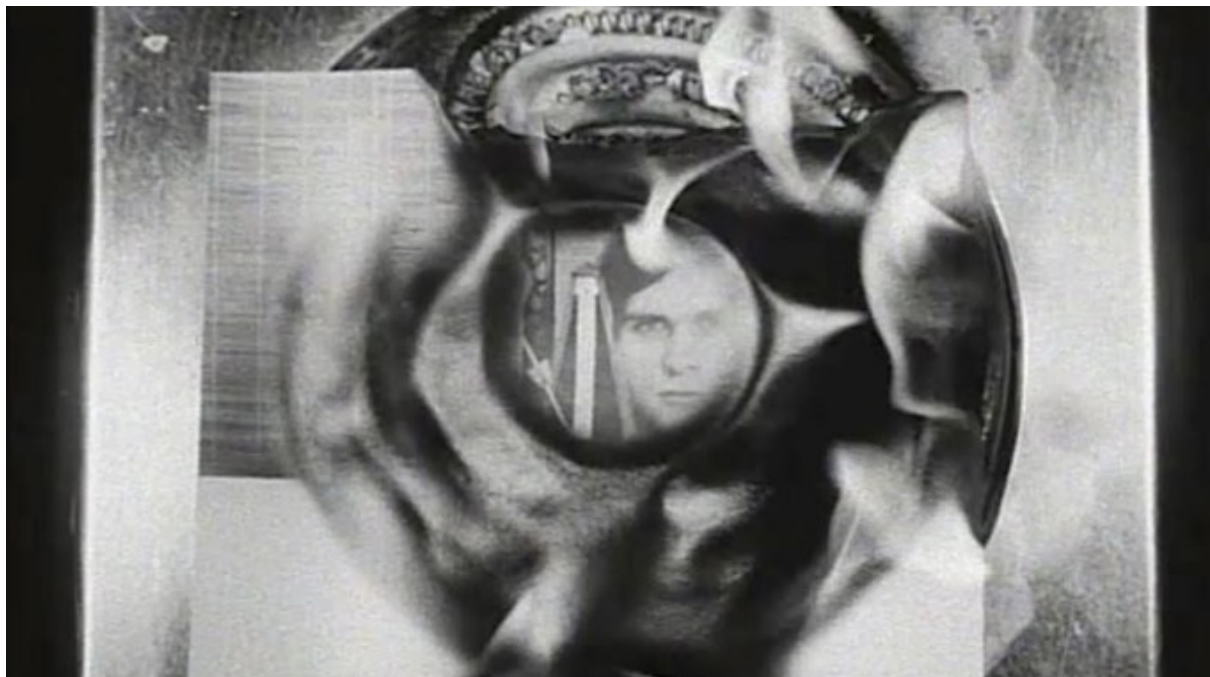
Still from Nostalgia

4 Rooms is an experimental short film shot from the window of my room. There is a big building in front of my house and it blocks all my view. I can watch nothing else but these four rooms. Each of these rooms have big windows, which generously shows me what happens inside. I observed inhabitants from those rooms and with time I got familiar with their living habits. In this film, the scene slowly zooms in on each room; meanwhile, the soundtrack of my descriptions of what was happening inside the room is playing in succession before the related image appears.