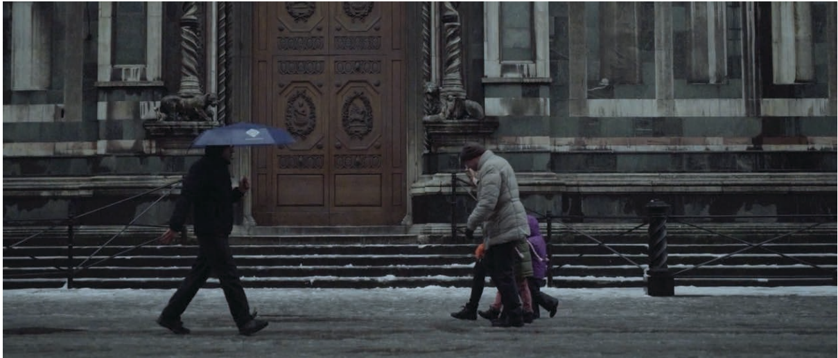
Still from Slow in Florence

As we all know, Florence is considered as the birthplace of the Renaissance, Revealing Rome in its art galleries and libraries, (THE CITY OF FLORENCE, ITALY. 1877) It is a place where people can easily capture the moment of beauty, especially for filmmakers, it seems like a random corner can be constructed as astonishing scenery in a film. There are many great films that framed in Florence, for example, the romantic film Light in the Piazza made by Guy Green in 1962, Florence left a sweet impression where a love story began, Clara, who is a mentally ill American lady, met an Italian man n Fabrizio on a sunny afternoon at a square in Florence. They fell in love at first sight and finally got married in Italy.