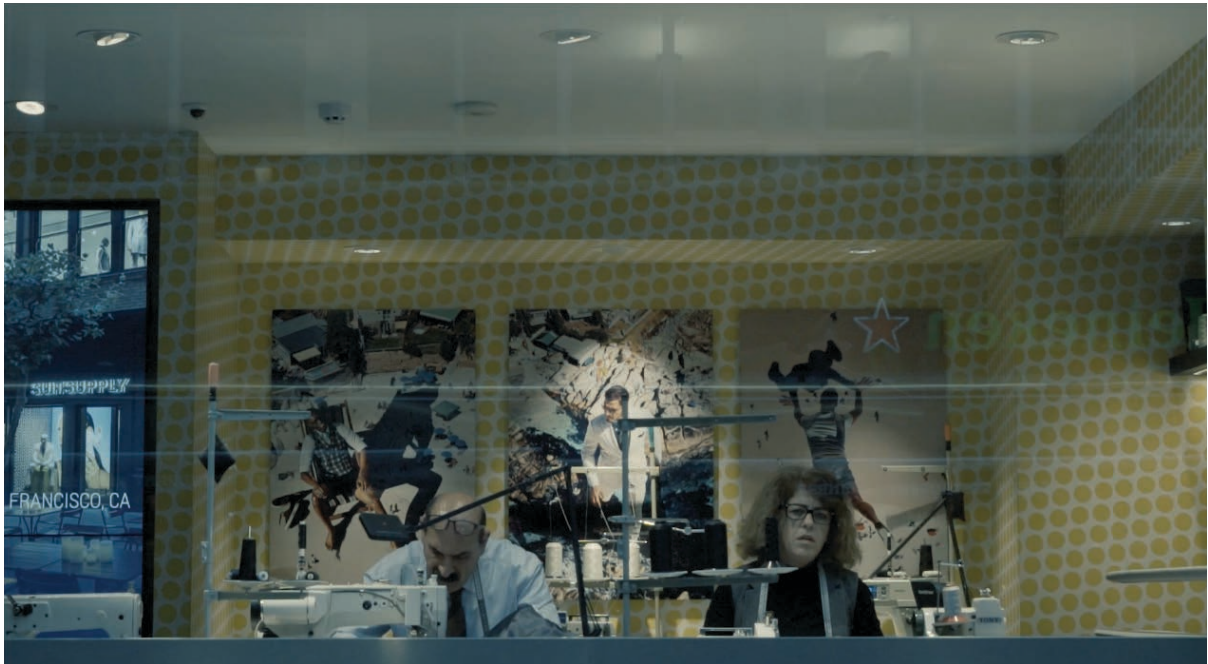
Still from Far From Home

Far from Home is my graduation project which is still working in process and I edited a short version which has been showed during the united exhibition at EYE Film Museum on March 2019. In the short version, I documented the view in Rotterdam, including the harbor, bridges, city center and train station, etc. I have carefully framed these views and the city looked extremely beautiful on screen. They preciously showed my impression of Rotterdam, which was modern, fantastic, beautiful but no sense of belonging. Along with images, I recorded daily conversations between my family and me on the phone, we talked about the living conditions from both side, they were curious about my life in Rotterdam and I asked them about changes in my hometown.