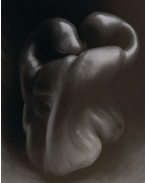
Pepper No. 30 by Edward Weston

First of all, I started working on the idea of a magical item, which brings sexual pleasure to human beings. This item needs to have a resemblance to the human form and it can be easily carried. In other words, I wanted to customize a new sexual interactive approach for humans.