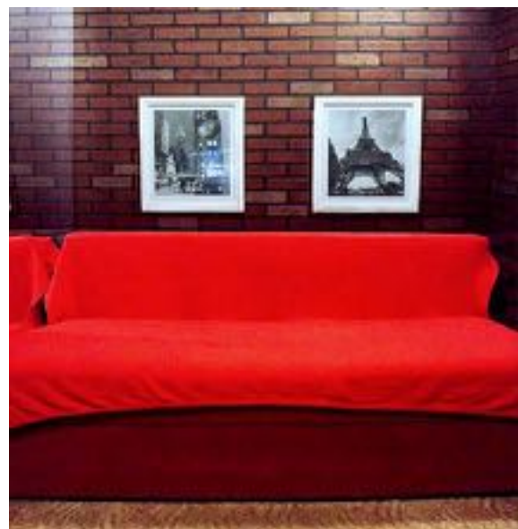
Room Dresden, Herzog Studio, Russia