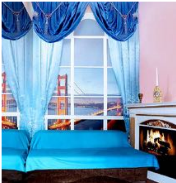
Room San Francisco, Herzog Studio, Russia