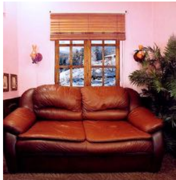
Room Quebec, Herzog Studio, Russia