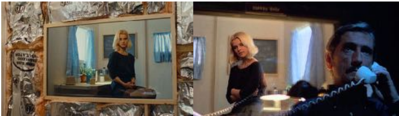
Paris, Texas, 1984

This could be in the form of an adaptation of the phone-scene in the film Paris, Texas (1984) by Wim Wenders.