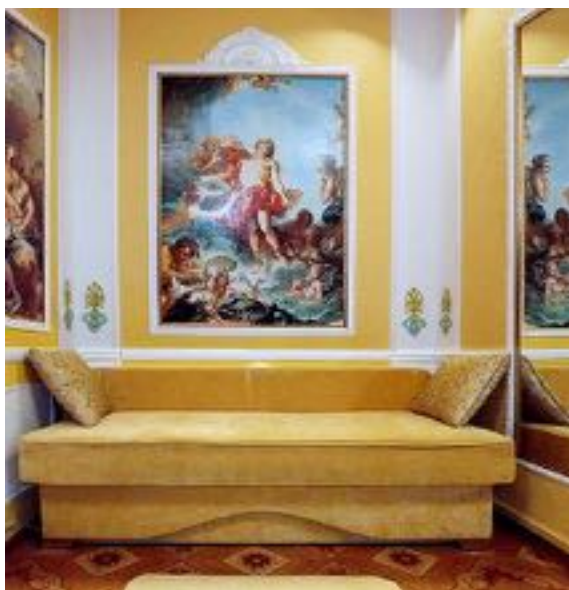
Room Belveder, Herzog Studio, Russia