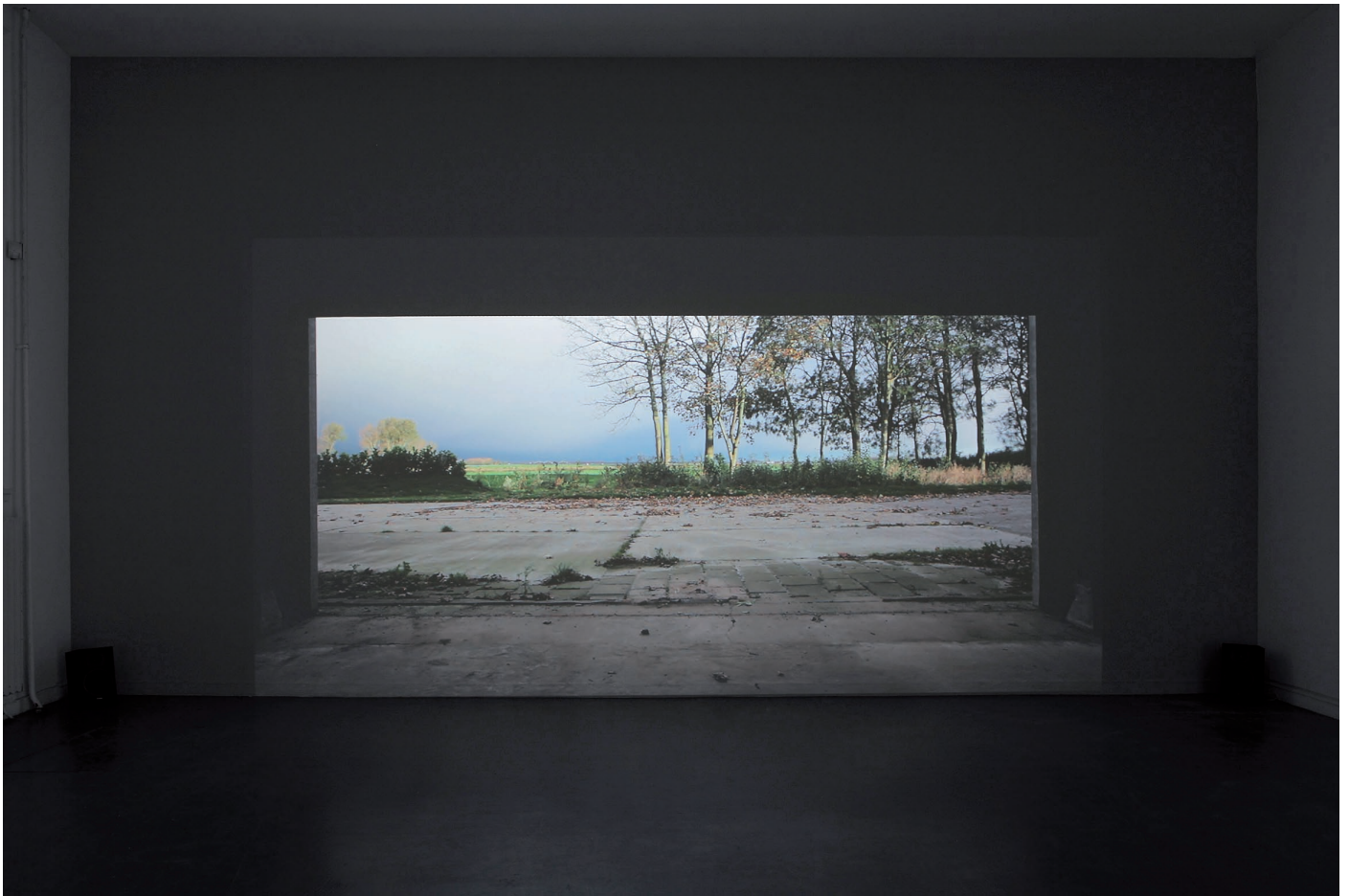
Exhibition view, Graduation Show Piet Zwart Institute Master Media Design and Communication Tent, Rotterdam 28.06.2013 – 25.08.2013