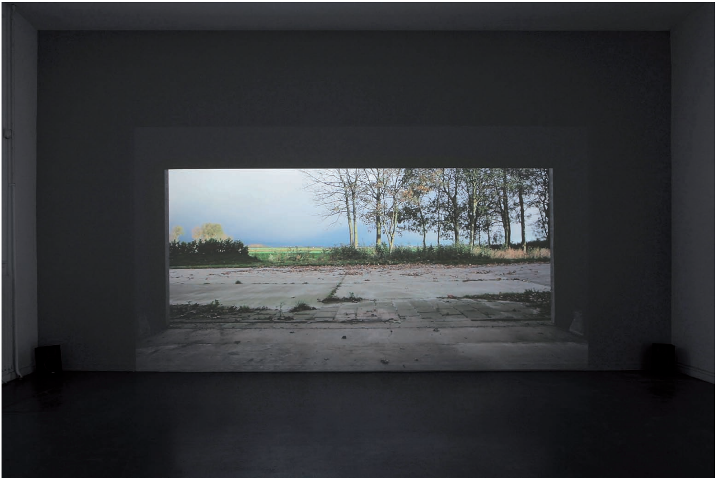
Exhibition view, Graduation Show Piet Zwart Institute Master Media Design and Communication Tent, Rotterdam 28.06.2013 – 25.08.2013