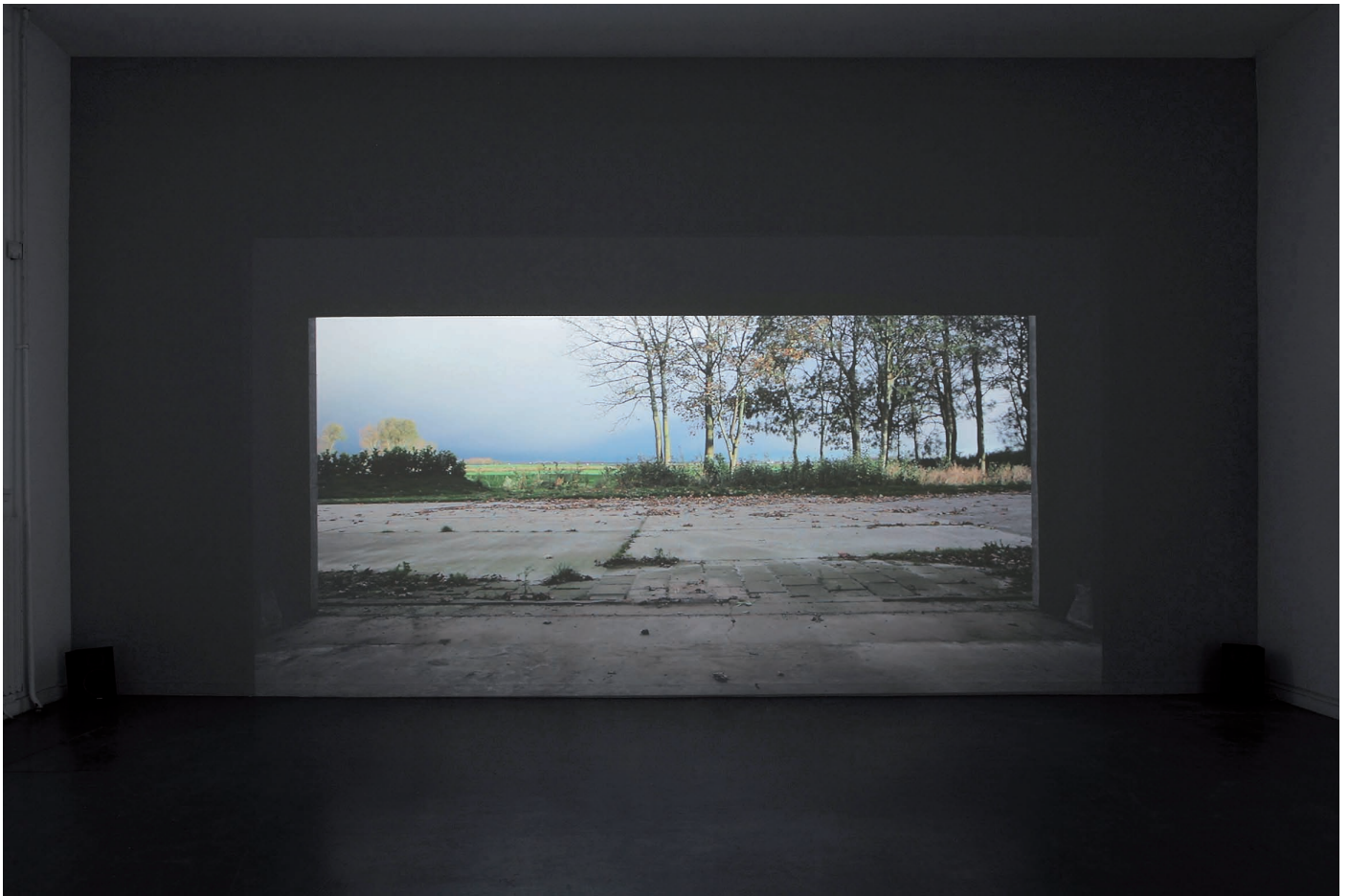
Exhibition view, Graduation Show Piet Zwart Institute Master Media Design and Communication Tent, Rotterdam 28.06.2013 – 25.08.2013