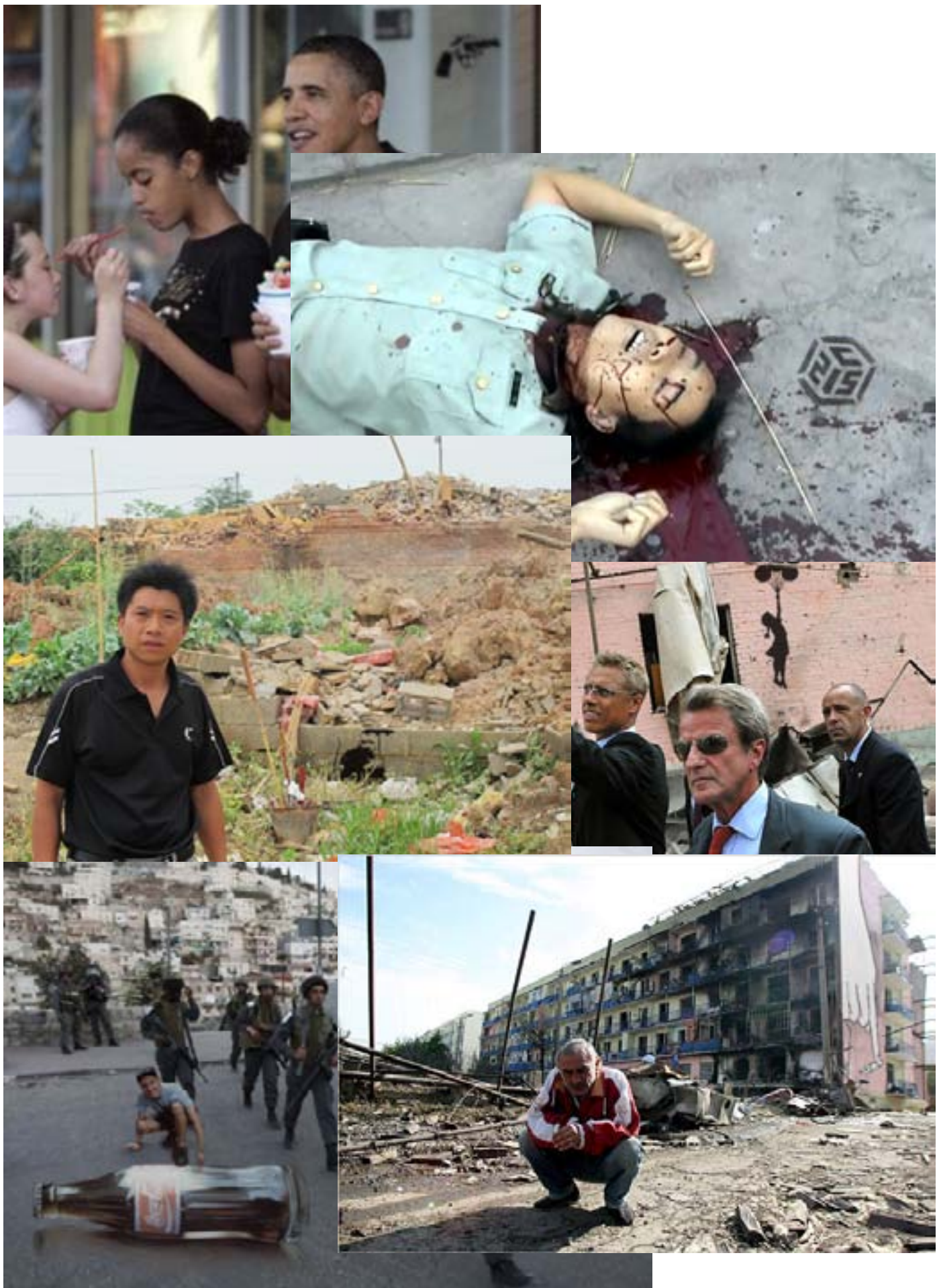
Picture (18) Virtual Streetart Collage (Famous street art images at different locations)