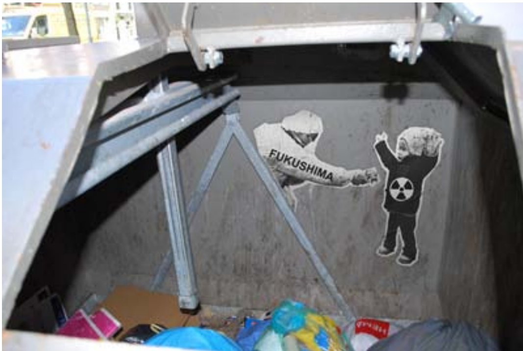
Picture (12) Fukushima Wheatpaste (Rotterdam,virtual streetart image)