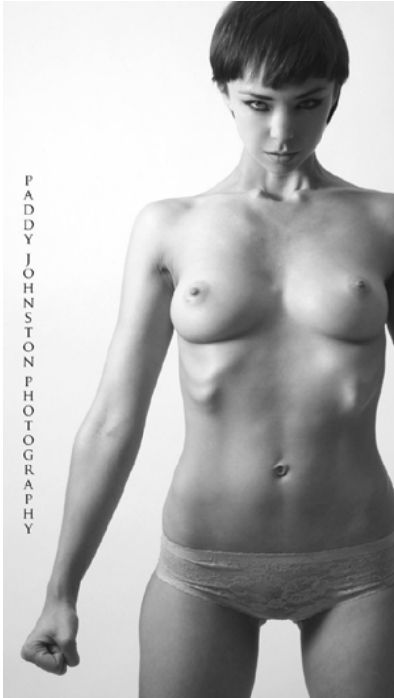
Picture (1) On the request of Boya (the internet meme)