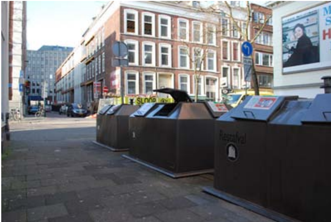
Picture (11) Fukushima Wheatpaste (Rotterdam,virtual streetart image)