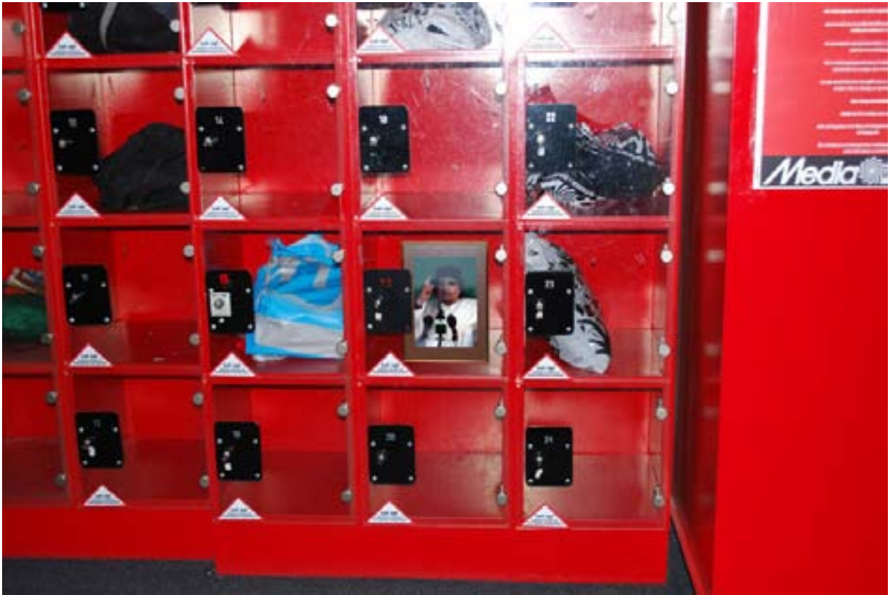
Picture (17) Media Markt Lockers (Rotterdam,virtual streetart image)