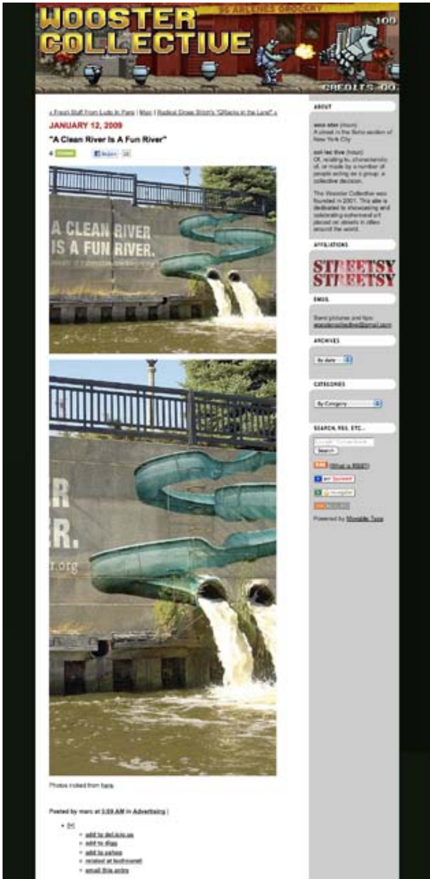
Picture (2) Virtual Milwaukee River Mural