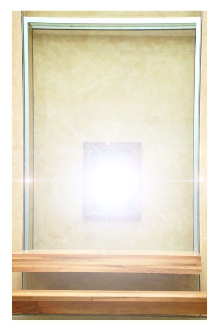
digital sketch of the idea, 'Their Mona'