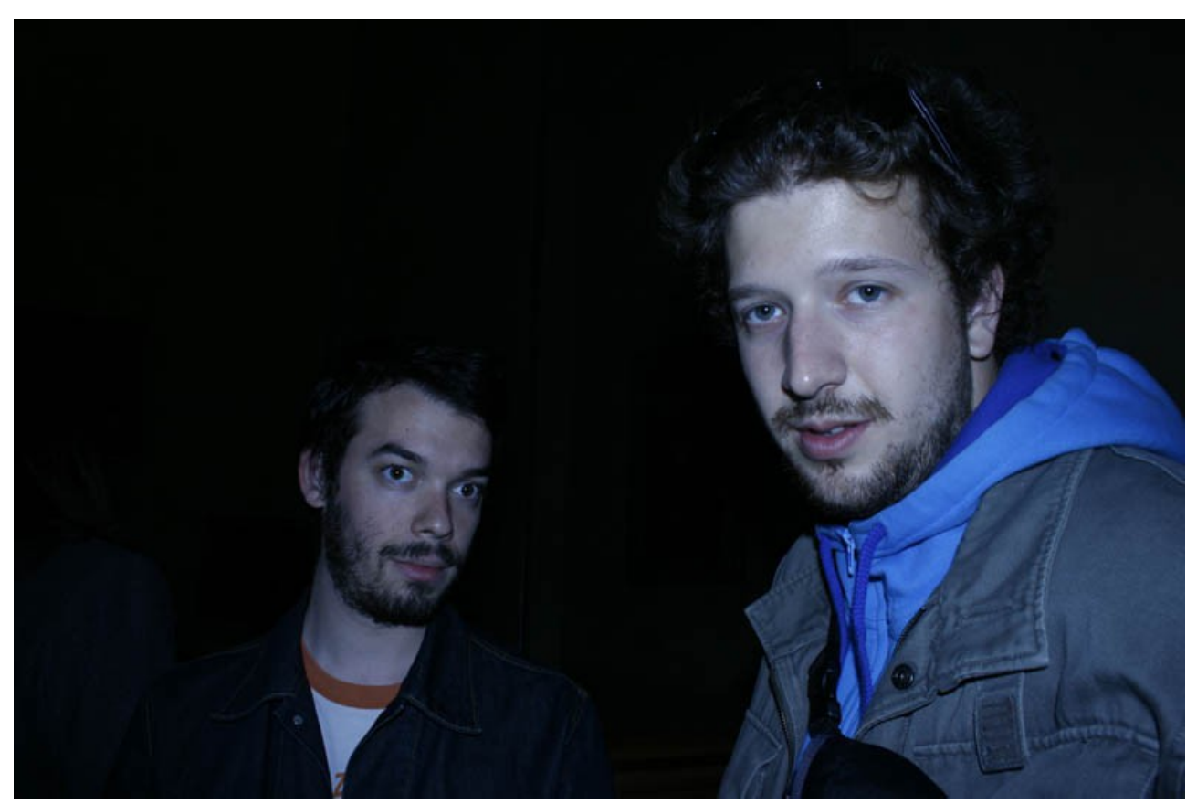
Me on the left, Mona Lisa in the middle and my friend on the right and our friend behind the camera invisible, subtracted from the photo.

I have came up with the idea to adjust the flash into extreme and fading the painting in the background between us into black. Following this One Night in Paris was born.