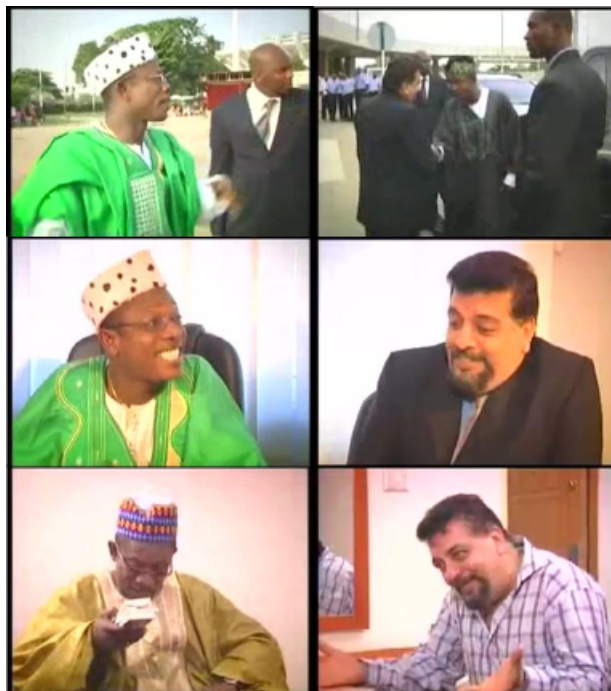
Figure 4: Stills from I Go Chop Your Dollar music video

However Chude-Sokei (2010) argues against this image of an African cyber-Robin Hood, by reminding us that the victims often belong to the same community as the spammers, and, I will argue, are even more desperate than the perpetrators. And if the scam happens to result in profit, no part of it will be invested into the public good, but rather paves scammers' way to become part of the elite and repeat its greedy behavior. The same way "I Go Chop Your Dollar" justifies the 419, the song "Yahoozee" - a clear reference to "yahoo boys", the pseudonym attributed to young Nigerian scammers - glorifies of the lifestyle that follows a successful scam 10