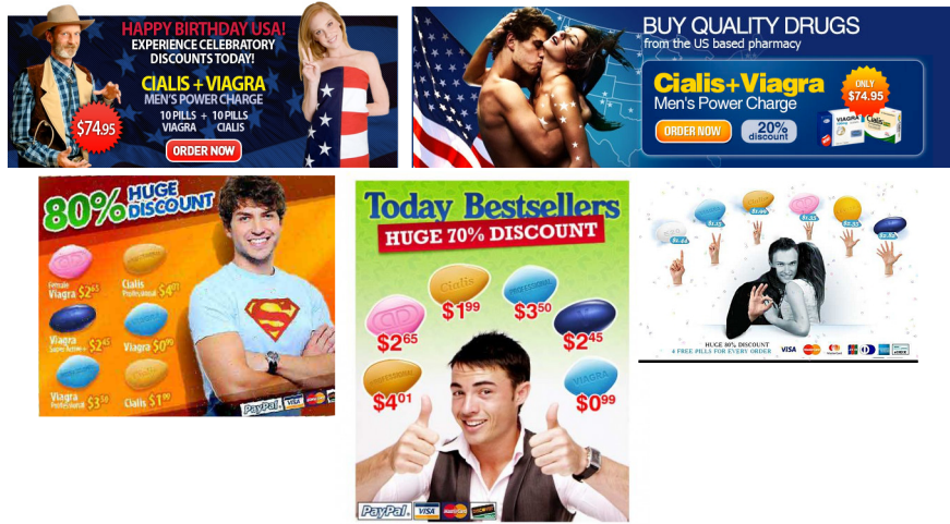
Figure 1: Images from medical spam