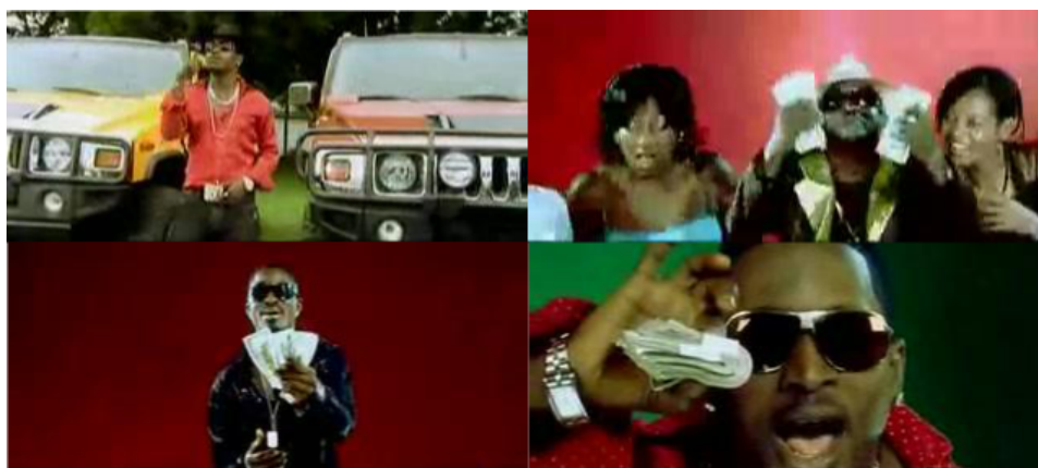
Figure 5: Stills from Yahoozee music video

However Chude-Sokei (2010) argues against this image of an African cyber-Robin Hood, by reminding us that the victims often belong to the same community as the spammers, and, I will argue, are even more desperate than the perpetrators. And if the scam happens to result in profit, no part of it will be invested into the public good, but rather paves scammers' way to become part of the elite and repeat its greedy behavior. The same way "I Go Chop Your Dollar" justifies the 419, the song "Yahoozee" - a clear reference to "yahoo boys", the pseudonym attributed to young Nigerian scammers - glorifies of the lifestyle that follows a successful scam 10