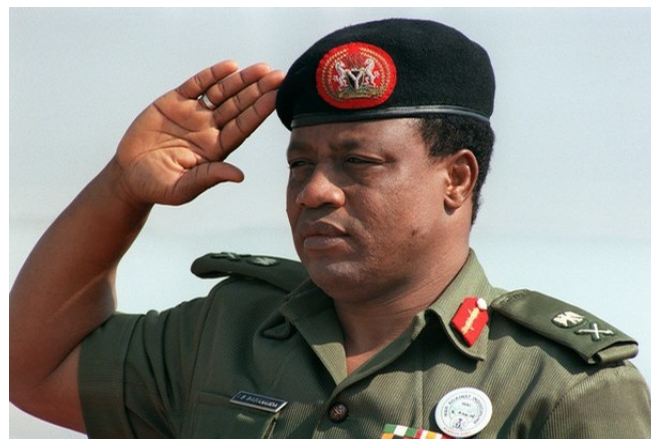
Figure 6: General Ibrahim Badamosi Babangida

At this point I believe it is possible to answer whether the fulfillment of these three features - deterritorialization, collective enunciation, and political dimension - which Deleuze and Guatarri recognized in minor literature, are sufficient to classify spam as