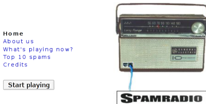
Figure 2: Spam Radio's website

broadcast. A more recent work that deal with 419 spam is More Songs of Innocence and of Experience by Thompson & Craighead 7 . The work emerged as a response to a commission for the online exhibition Our Mutual Friends , which revolved around Charles Dickens' novel Our Mutual Friend . The artists decided to explore the resemblances between Dicken's romanticism and realism, and the language of contemporary spam messages. The end result became a series of karaoke videos, with spam email's as lyrics. The songs are accompanied by MIDI version of light music.