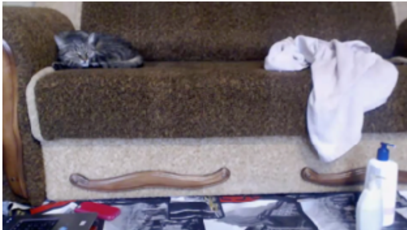
Still from my work BRB (2018)

back or go online. The chat that occurs when the girls are gone sometimes create funny situations where others have a darker context.