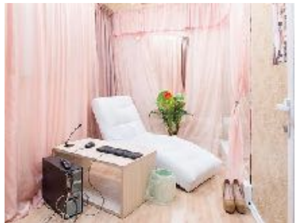
Photo of a webcam set

In extension tho the notion of spaces I am also interested in the webcam model ‘sets’. While there are a lot of webcam models camming from their own personal environment (bedroom, livingroom, kitchen, etc.), there are also a lot of models that rent a ‘set’, like a porn-set these are equipped with everything necessary for the show. But these rooms are impersonal and identity-less if you compare them to the personal rooms of some models. These sets where girls work from are mostly located in eastern Europe and the girls who work for these company’s have to hand in up to 75% of their income to pay for these companies their services. I’m curious what these spaces look and feel like.