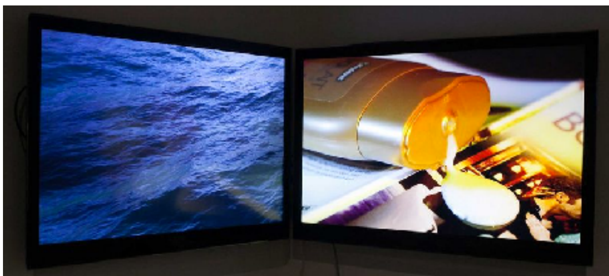
Installation view On Holiday (2018)

In this work my different fascinations and interest come together; sexuality, ownership of body, the power structure and distribution regarding online sex and sex-work, identity, online communities and privacy.