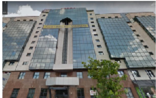
Locations of webcam companies