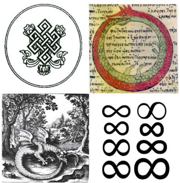
Religious, mystic and alchemical iconography depicting notions of infinity and eternity from different cultures.

Belonging in the abstract realm of omnipotence, omniscience and the like, the notion of infinity is what the father of cybernetic, Norbert Wiener calls an indeterminate form; something that doesn't conform to the ordinary conditions of a number or quantity (Wiener, 1964, p.g 7). It is this indeterminacy, an abstraction of the unlimited, against something that is determinable– the span of human limits, that provokes Wiener to ask the paradox of this question: “[c]an God make a stone so heavy that He cannot lift it?” (Wiener, 1964, p.g 6). The inconsistency of subjective experience vs. the physical world is the elastic twilight zone that has inspired generations of scientists, philosophers, diviners and religions in each of their endeavours to solve the greater meaning of life. In the same vein that Wiener talks about the paradoxes that centre around the notion of infinity, Marie-Luise Von Franz goes