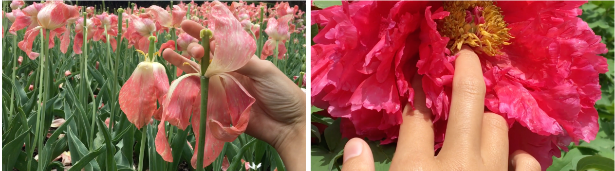
Stills from Sweet little flower , (2021)

In 2017 my mother and I went to a garden in springtime and saw voluptuous flowers spilling their blooms everywhere. They looked soft, inviting, and yielding. I reached out and touched them, fondled their insides, stroked the revealed stamens, knocking off drooping petals, and tore off crisp pink petals.