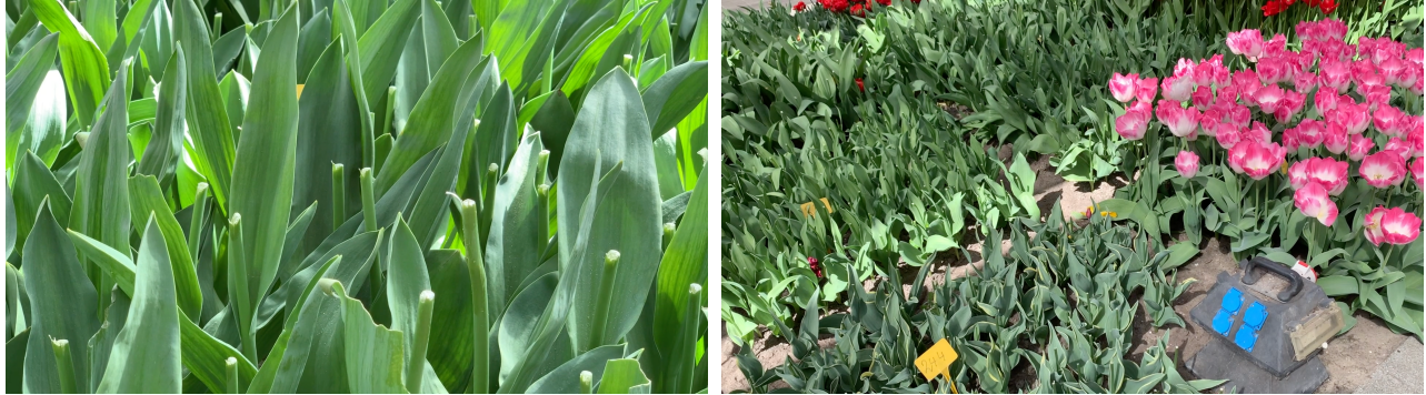
Stills from Drench Your Lips In Rich Luxurious Color (2021)

As in my book "See You Soon" (2016) which explores vulnerability, desire, exhibitionism/voyeurism, and power dynamics within an intimate relationship, "Look Natural In Any Light" considers these same themes within the relation between human beings and flowers.