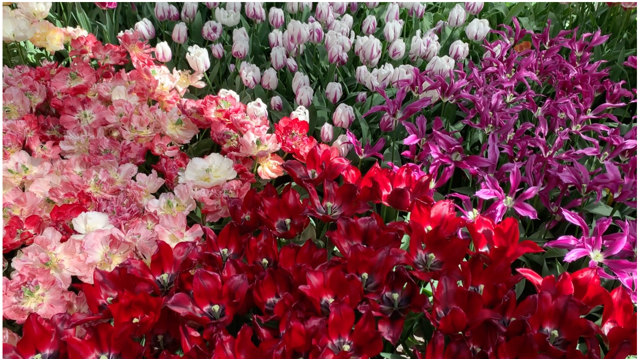
Still from Drench Your Lips In Rich Luxurious Color (2021)