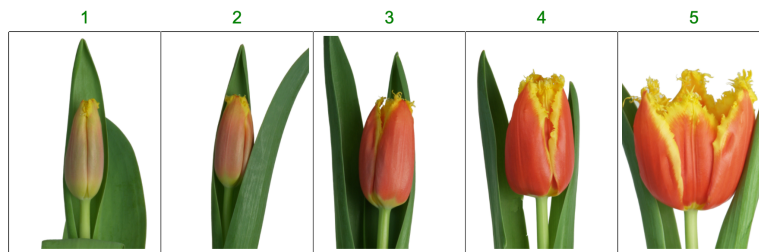
Rijpheid / Stages of opening / Reife