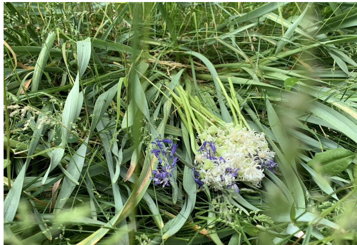
Spent flowers laying in a pile of grass

The work will be shot on my phone to retain a quotidian view, keeping at the level of the flowers and their experience. Phone footage is accessible, mundane, easily reproducible, illustrating the commonality and mundanity of the flowers and of the violence enacted onto them.