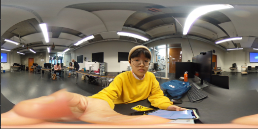
360 Camera , looking at the whole space