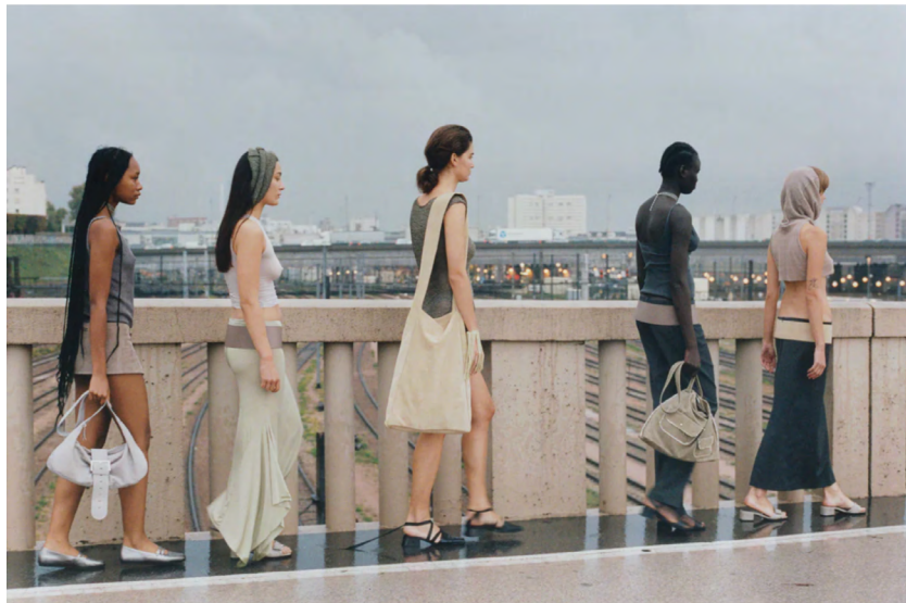
Paloma Wool SS 23