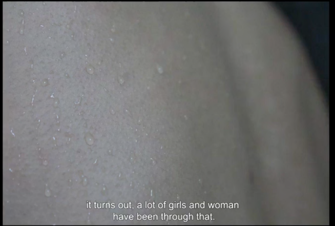
it turns out, a lot of girls and woman have been through that.