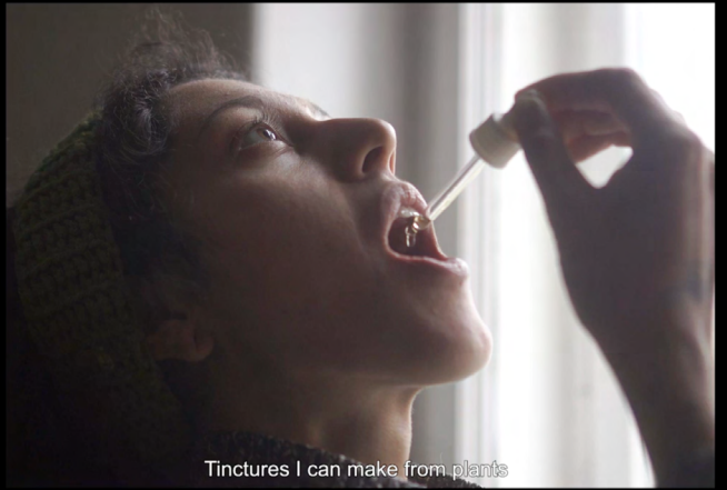
Tinctures I can make from plants