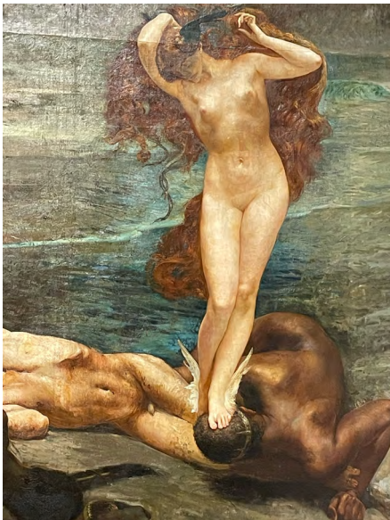
La Gorgone e gli eroi

The ecofeminist approach generally argues that both women and nature have been dominated and degraded by patriarchy and capitalism. Ecofeminism seeks for a holistic and compassionate relationship between humans and the environment (all critters), imagining sustainable and equitable ways of coexistence.