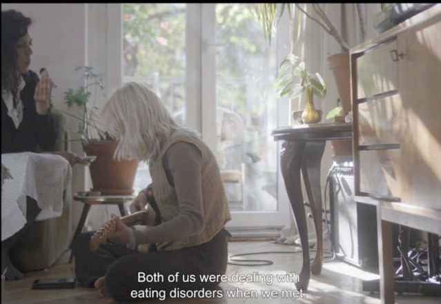
Both of us were dealing with eating disorders when we met.