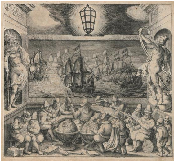
1. Book frontispiece of the sailing handbook " Licht der Zeevaert " ("The light of navigation") by (1608)