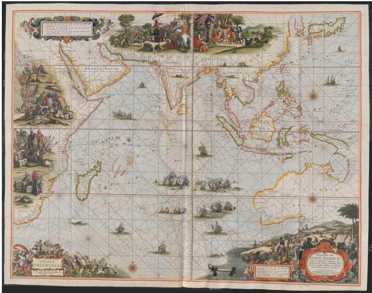
2. Map of the Indian Ocean by Hendrick Doncker, roughly dating back to 1664.