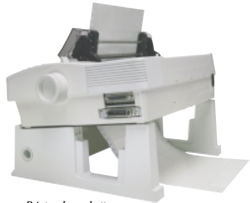
Printer shown bottom feeding labels on the optional printer stand