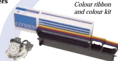
Colour ribbon and colour kit