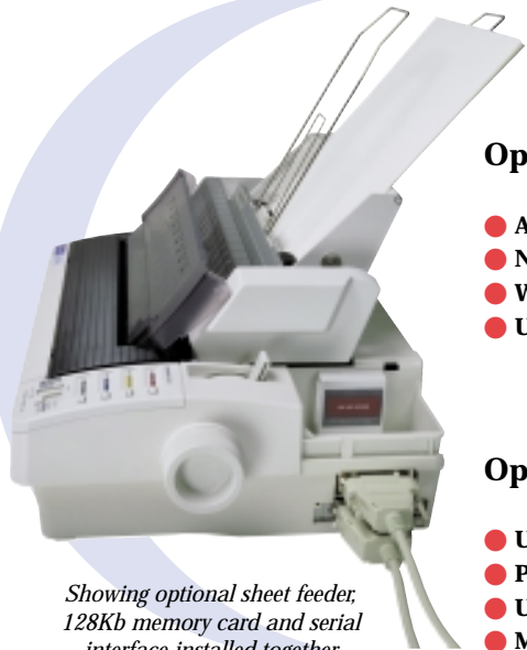
Showing optional sheet feeder, 128Kb memory card and serial interface installed together