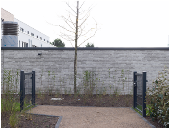
Fig. 7 (left) Fig. 8 (right)

Showing explicitly new built and contemporary residential spaces, the photographs inhere a familiarity but are framed to concentrate on the quirkiness of the scenes. This is referring to the infantile humanity and a zeitgeist that were used to create the spaces.