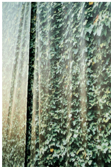
Fig. 2 (left)

Shadow of a presumably real tree on the concret and artificial print of fake leaves.