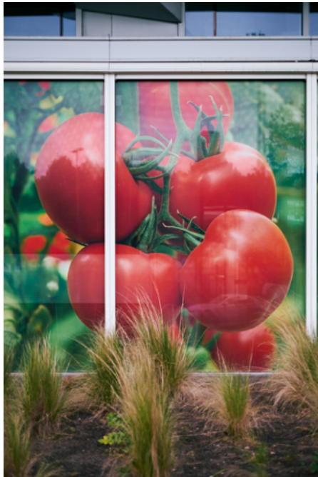
Fig. 4 (left)

Adding to this is the reproduction as a photographic print, that is autonomically creating new proportions of scale, differing to the real-world experience. First scaling it down on the surface of the photographic film respectively the digital sensor and later scaling it up, possibly enlarging objects. For the exhibition of the photographs, I plan to exhaust the possibilities of blowing-up the scenes, taking up on the large-format prints used for advertising or decoration in the public space (Fig. 4, 5), as well as scaling objects down. This shall further isolate scenes and make them figurative.