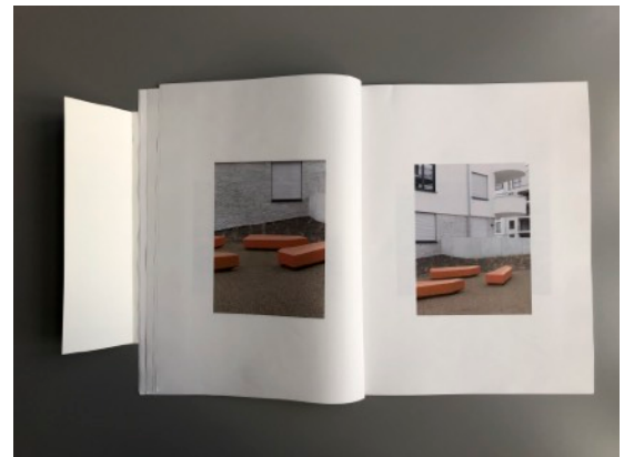
Fig. 6 a, b, c

left: cover of "Wohnen" right: two inner pages