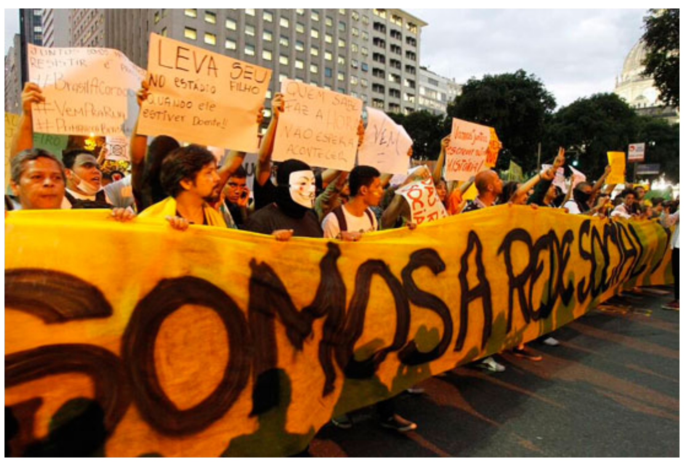
This protest banner in Rio de Janeiro from June 17 reads, "We are the social network!" See \rightarrow .